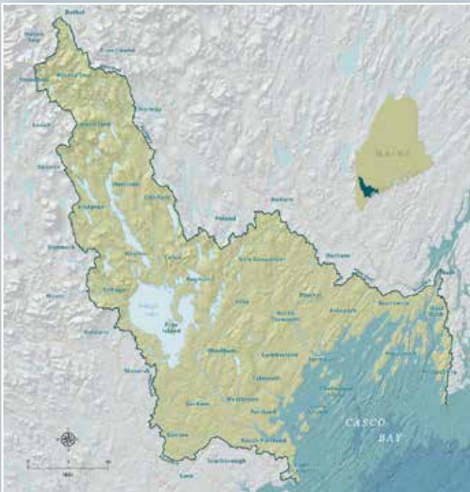
A map of the Casco Bay watershed, provided by the Casco Bay Estuary Partnership.